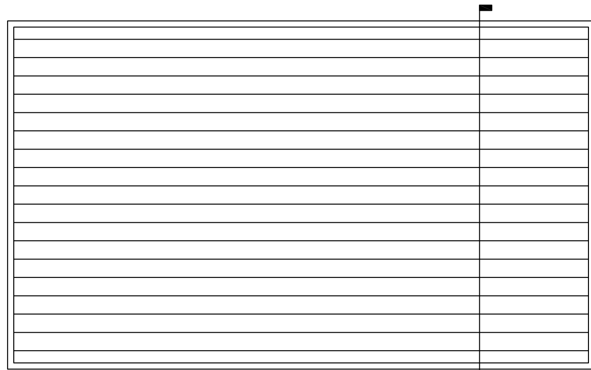
1 ROOF PLAN Scale: 3/8"=1'

NOTE: ALL DIMENSIONS ARE TO BE DETERMINED BY THE ARCHITECT AND ENGINEER.