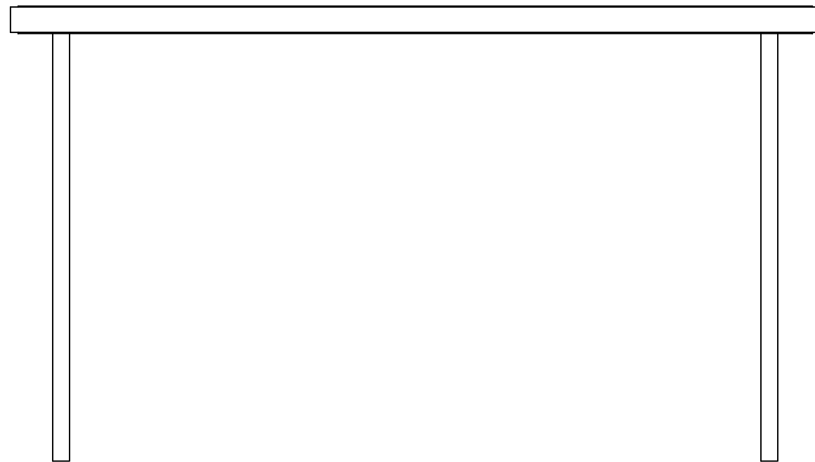
2 ELEVATION Scale: 3/8"=1'