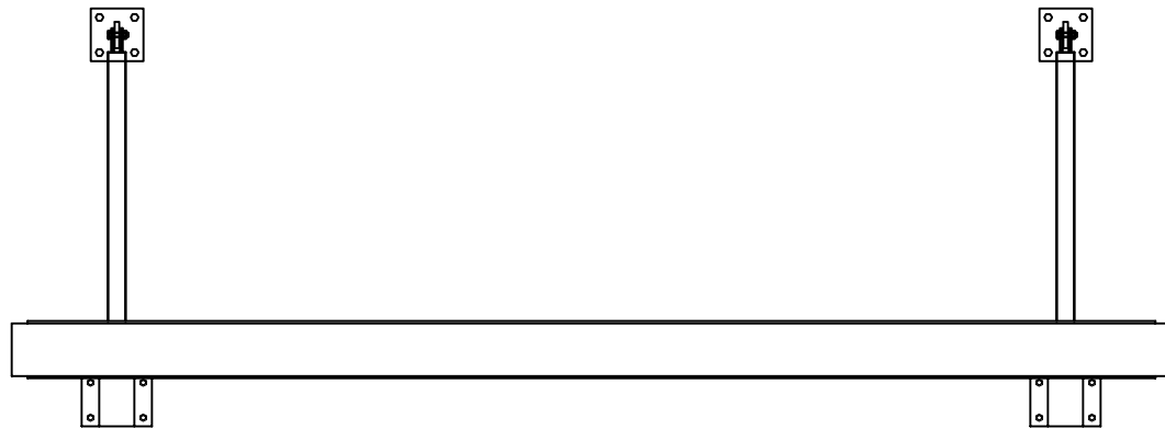
2 FRONT ELEVATION Scale: 1/2"=1'

NOTE: ALL DIMENSIONS ARE TO BE DETERMINED BY THE ARCHITECT AND ENGINEER.