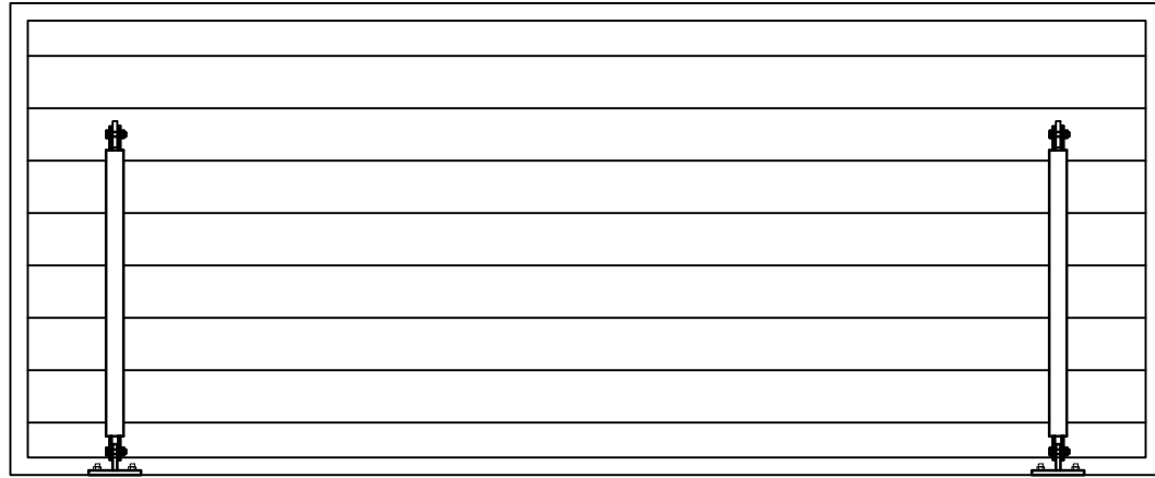
1 ROOF PLAN Scale: 1/2"=1'